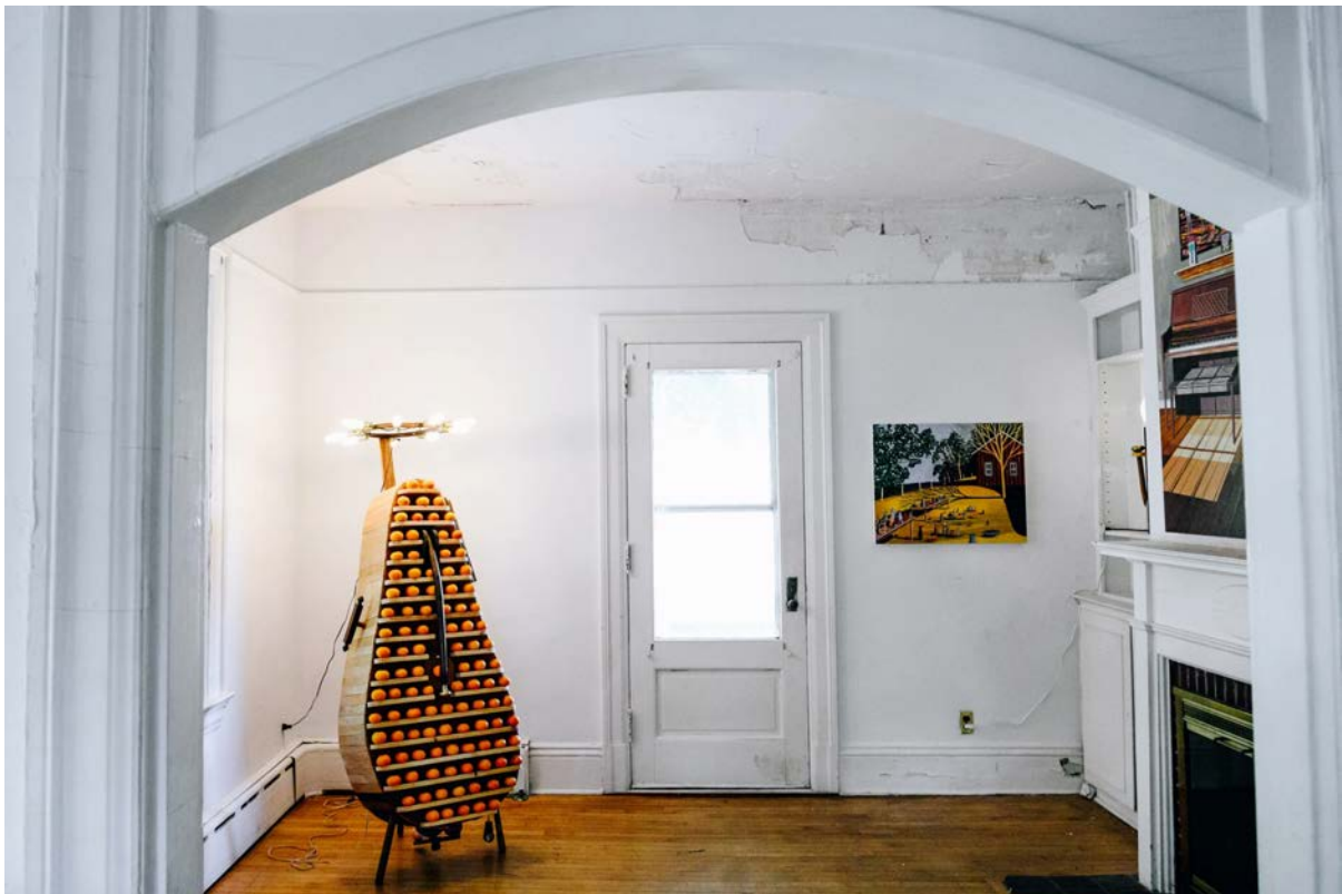
At NADA House on Governors Island, a wood sculpture by Colby Bird at the presentation by Halsey McKay Gallery seems to have stepped out of a painting by Magritte.